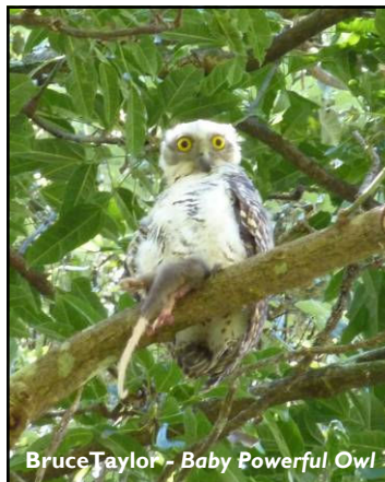
Bruce Taylor - Baby Powerful Owl

Following the floods last February, the Flying-fox Reserve Bushcarers have been wondering how to grow native trees such as coachwoods along the banks of Stoney Creek. With assistance from Ku-ring-gai Council we will try long stem planting of coachwoods and several other native canopy trees. If you would like to help us get them into the ground when they are ready to plant, do let us know.