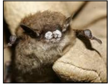
Little brown bat; close-up of nose with fungus, New York, Oct. 2008.

New Jersey experts are contemplating capturing several dozen infected bats from hibernation sites over the next month and taking them to a centre where they would be