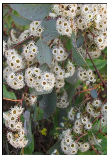
Eucalyptus baueriana - Ross Rapmund

might also be utilised by flying foxes, was also in full flower on the day of our visit.