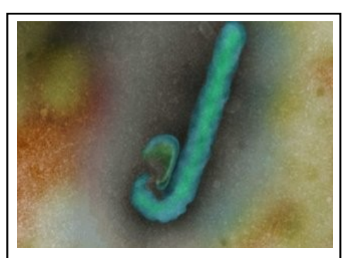
Electron micrograph of Ebola virus

"I think we've got a long way to go until we come up with a therapeutic we can translate from what we're learning from bats into humans." (continued P 4.)