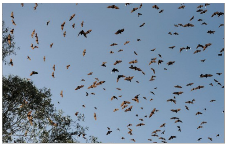
Hundreds of grey-headed flying foxes soar over Commonwealth Park in January 2014.

"Babies were recorded last spring in Canberra, so it will be interesting to see if there are babies in the colony this [year]," she said.