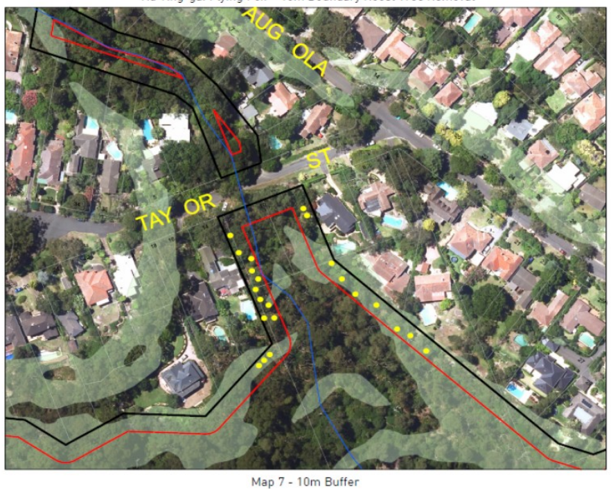
Map Legend - Black line – boundary of Ku-ring-gai Flying-fox Reserve; Red line – 10m buffer; Yellow dots - Trees to be removed if adjacent resident approves; Green shading – slope more than 18 degrees.

Ku-ring-gai Flying Fox - 10m Boundary Roost Tree Removal